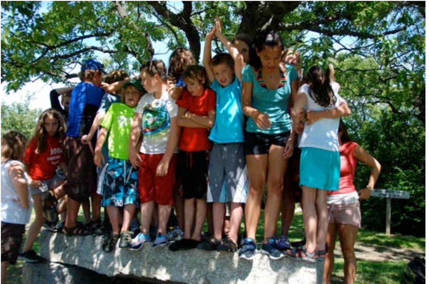
Adventure Sea Camp doing initiatives at Halibut Pt State Park