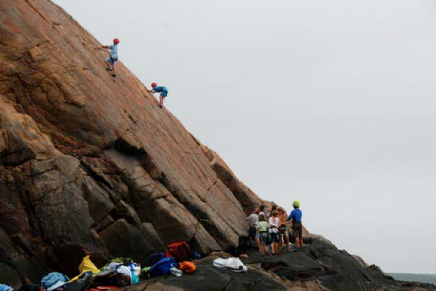
Adventure Sea Camp rock climbing on Salt Island